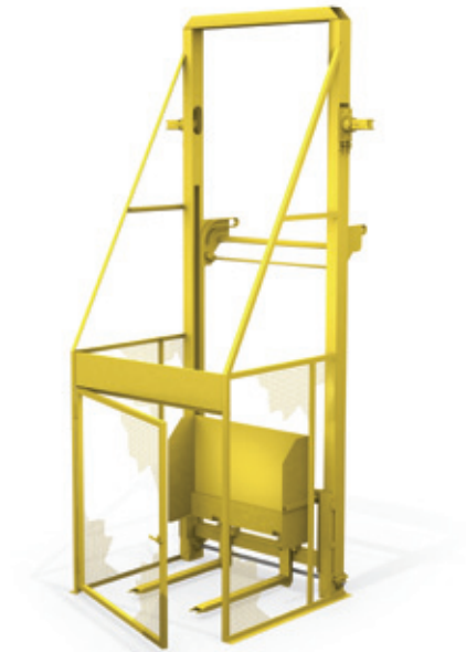
CD-109-FP (Fork Pocket)